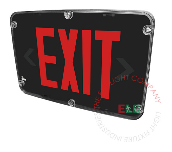
The WLEX4X Series is not only ideal for wet locations, its durable design is also resistant to corrosive atmospheres and harsh environments.