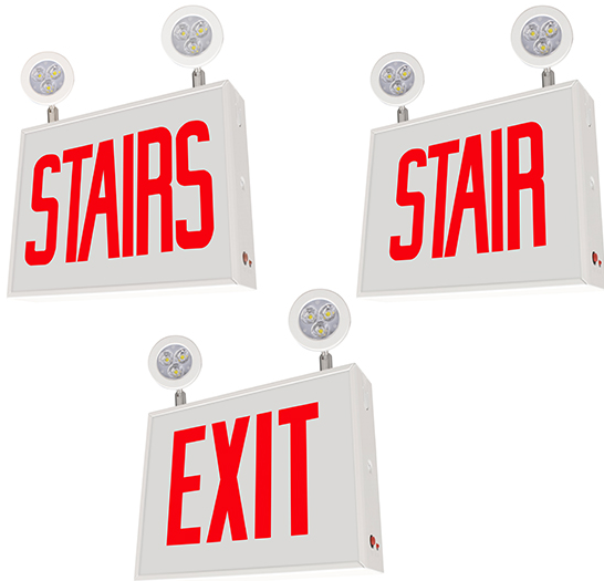
City of Chicago approved LED Combo Exit sign with steel housing and glass face