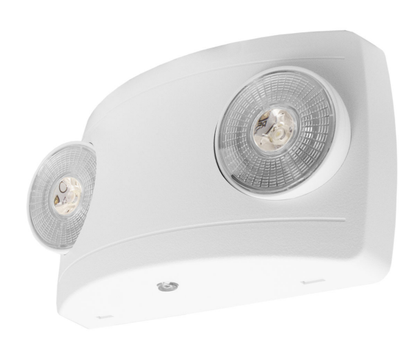
The EL-C2 series offers UL listed emergency lighting in an affordable package.