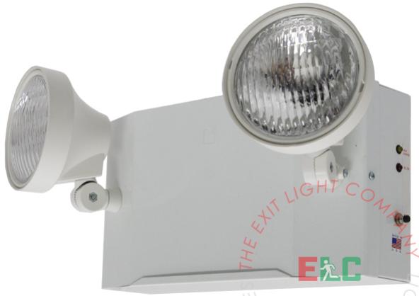
Steel Housing LED Emergency Light - Approved for New York City. Heavy Duty Construction. An efficient and secure 6 Volt Heavy Duty Emergency Light.