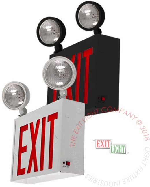
New York City Approved Exit/Emergency Light Combo with LED Energy Savings.