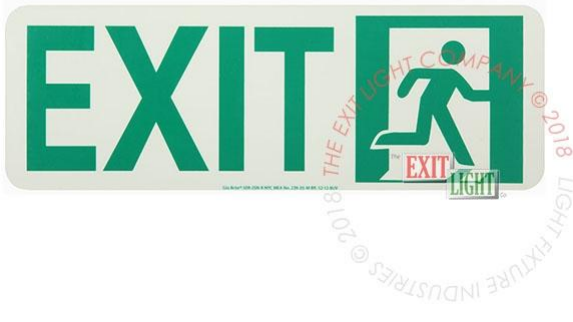
A simple, Glow in the Dark Exit Safety Sign.