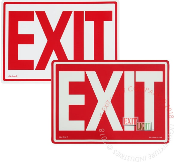
A simple, Glow in the Dark Exit Safety Sign.