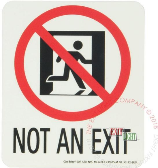
A simple, Glow in the Dark Not An Exit Egress Sign.