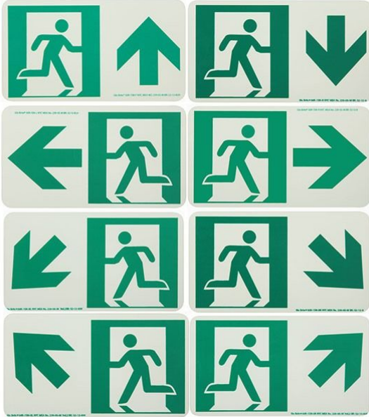
A simple, Glow in the Dark Running Man Egress Safety Sign with Exit Arrows.